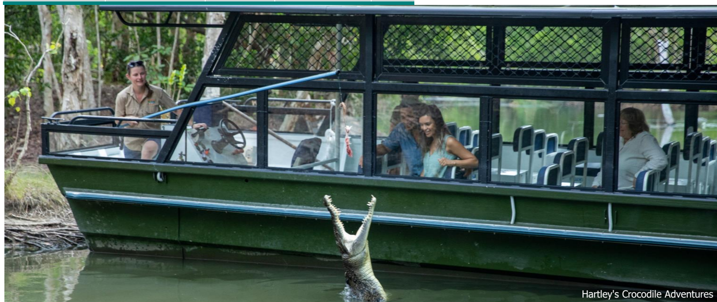
Hartley's Crocodile Adventures

Regional snapshots for all Queensland regions are available on the TEQ website. Overview snapshots are also available for both domestic and international visitors. www.teq.queensland.com . If you have any questions or comments, please email research@queensland.com . For tourism region definitions, please see https://www.tra.gov.au/Regional/tourism-regions .