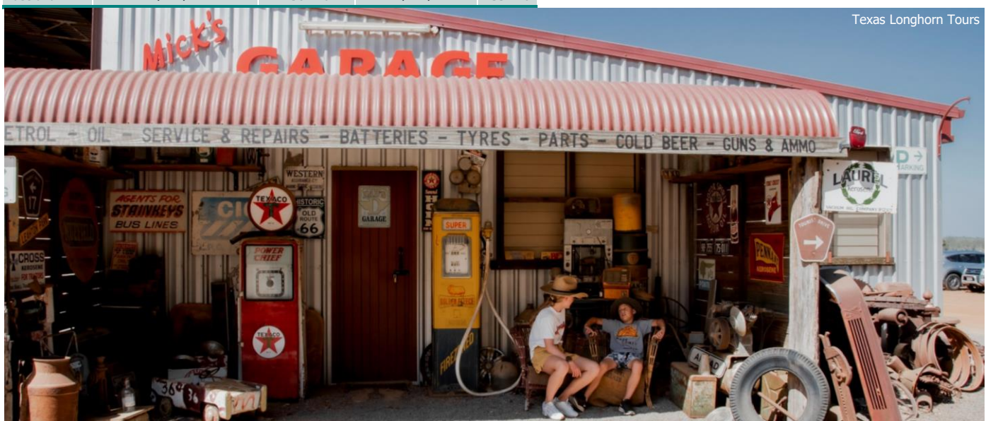
Texas Longhorn Tours

For tourism region definitions, please see https://www.tra.gov.au/Regional/tourism-regions .