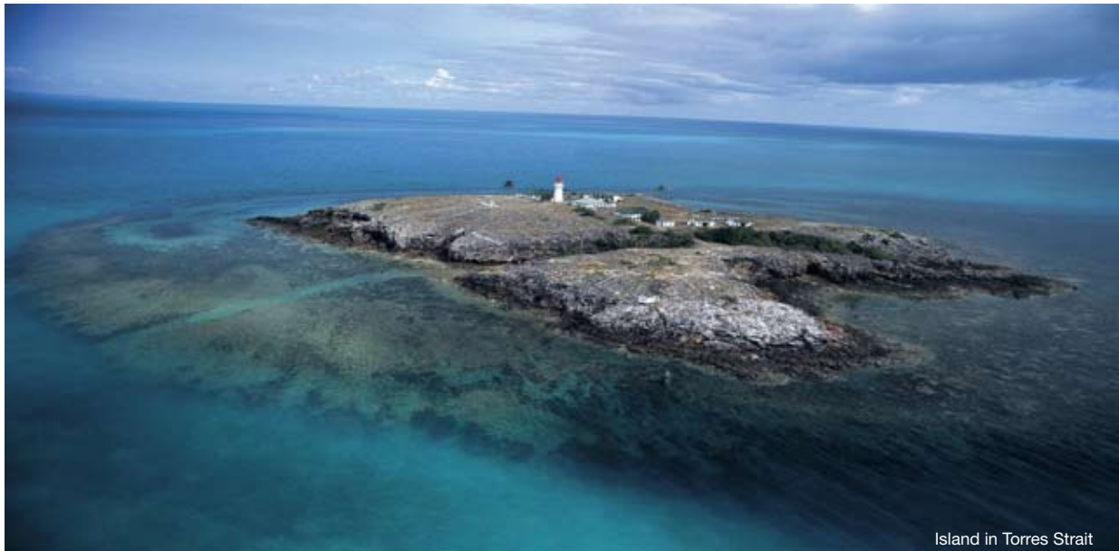
Island in Torres Strait