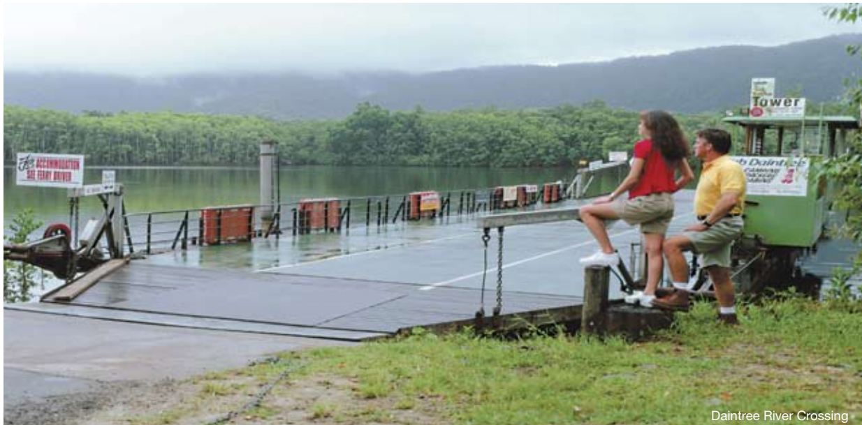
Daintree River Crossing