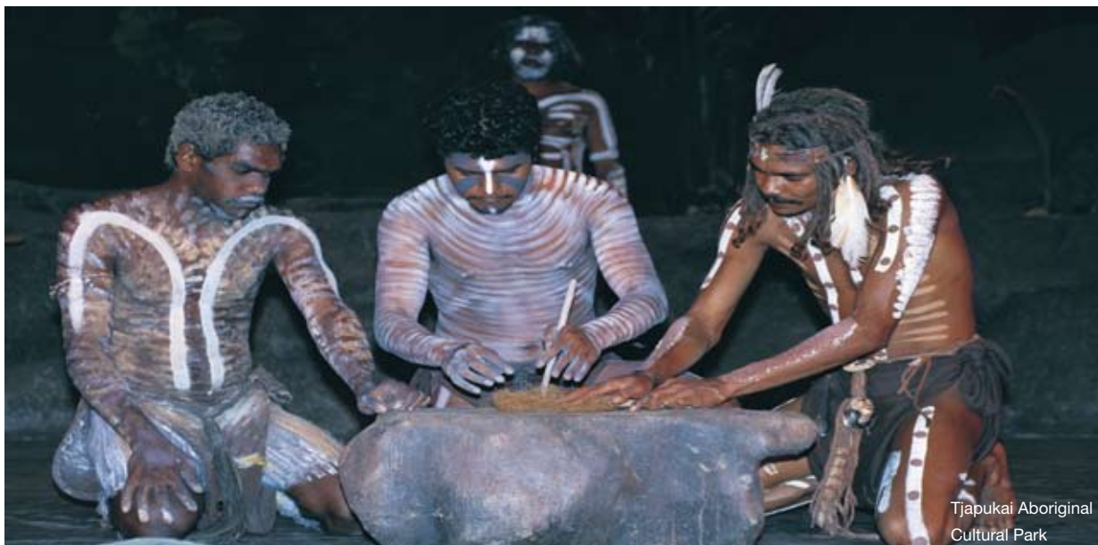
Tjapukai Aboriginal Cultural Park