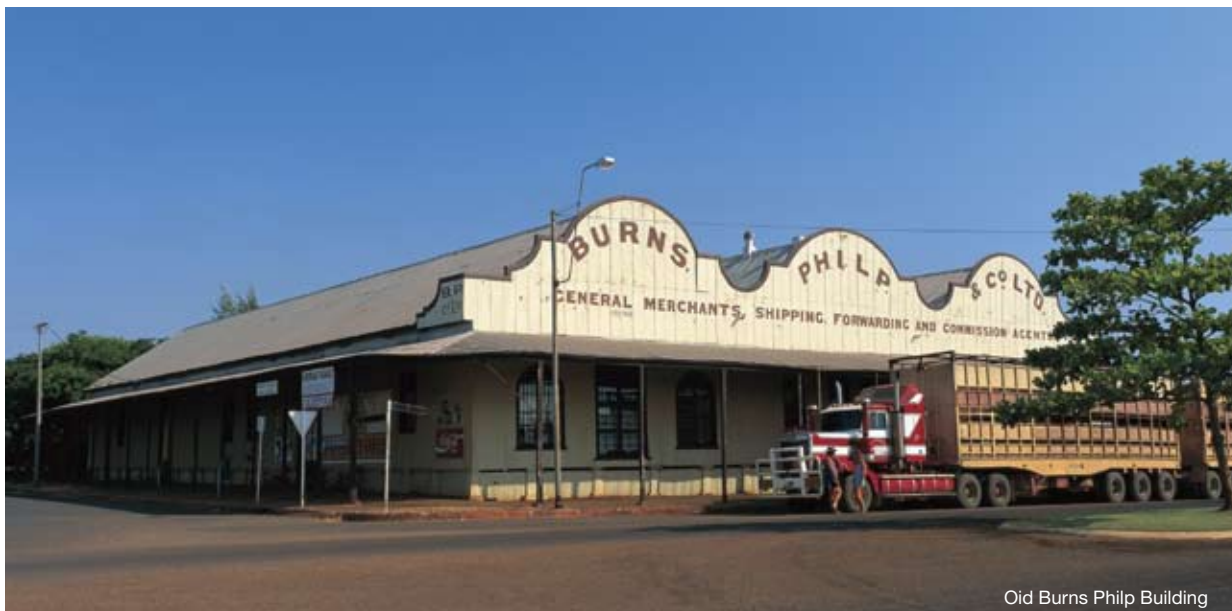
Old Burns Philp Building