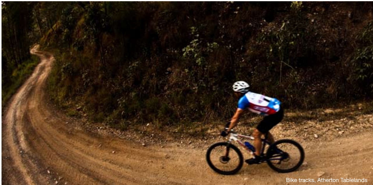
Bike tracks, Atherton Tablelands