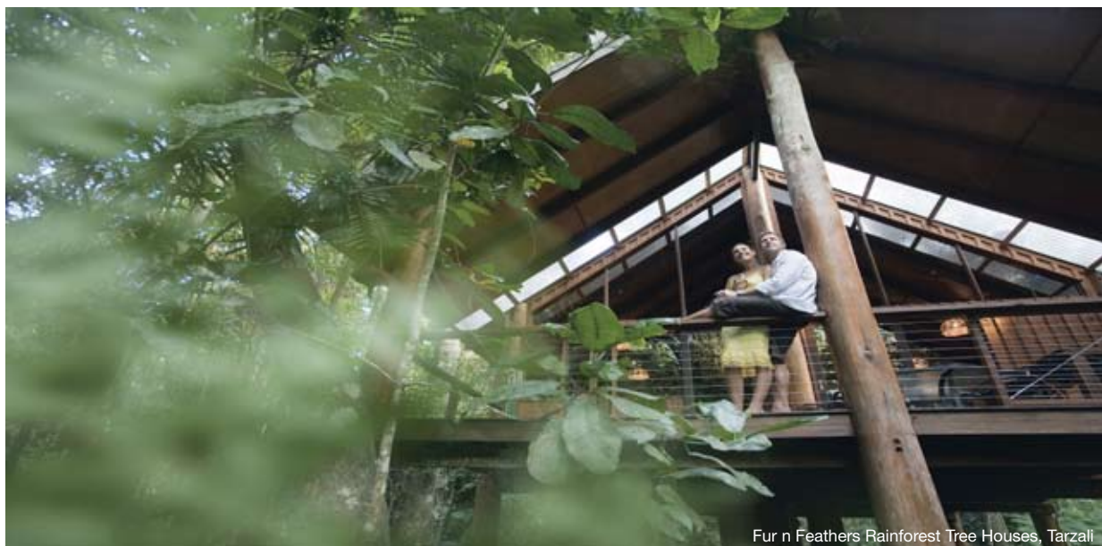
Fur n Feathers Rainforest Tree Houses, Tarzali