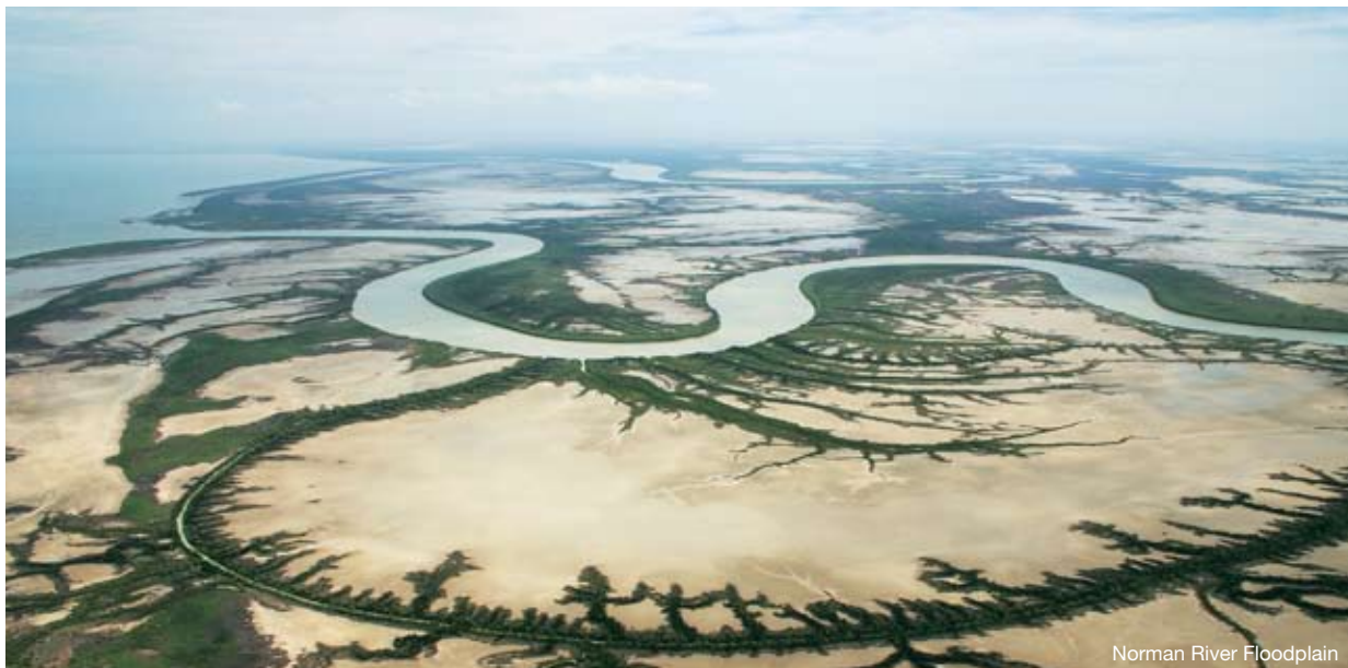
Norman River Floodplain